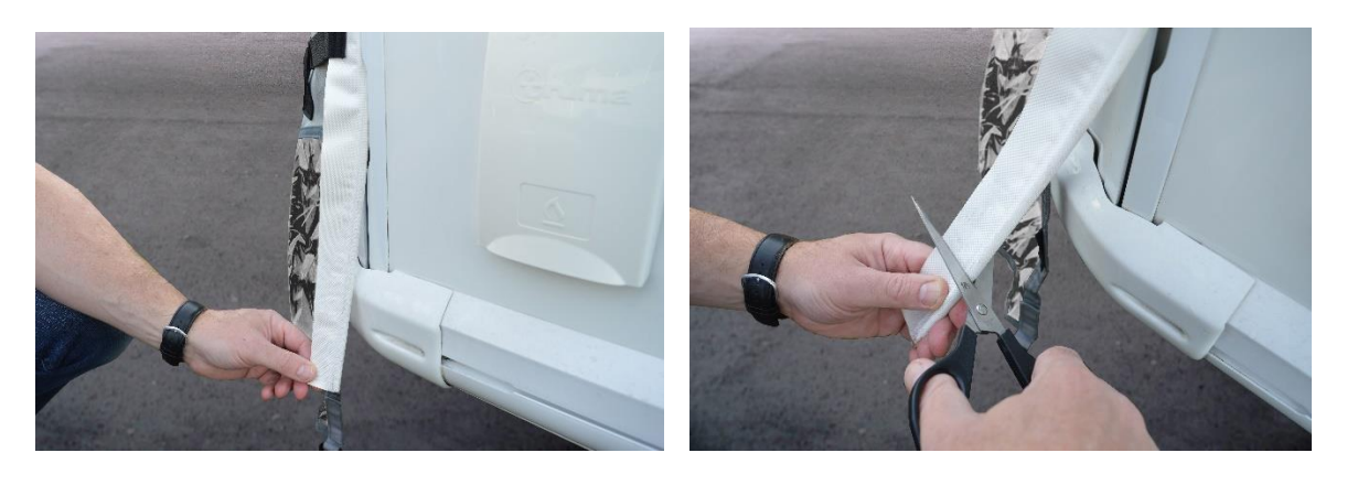
Note – measure this carefully before cutting.

Once central and with the cover sitting just above the drawbar; adjust the top straps to create tension at the top of the cover.